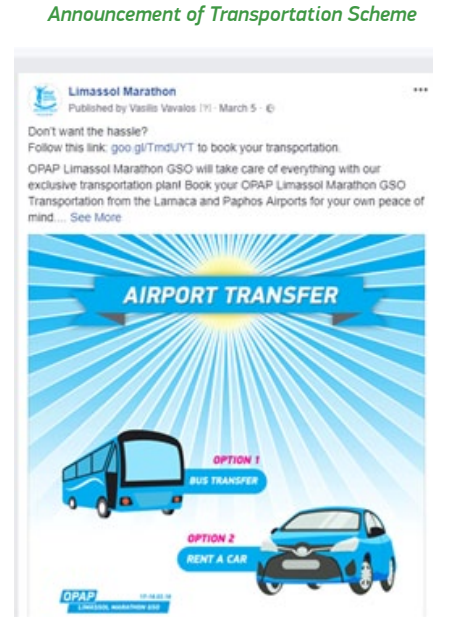
Public Transport Awareness